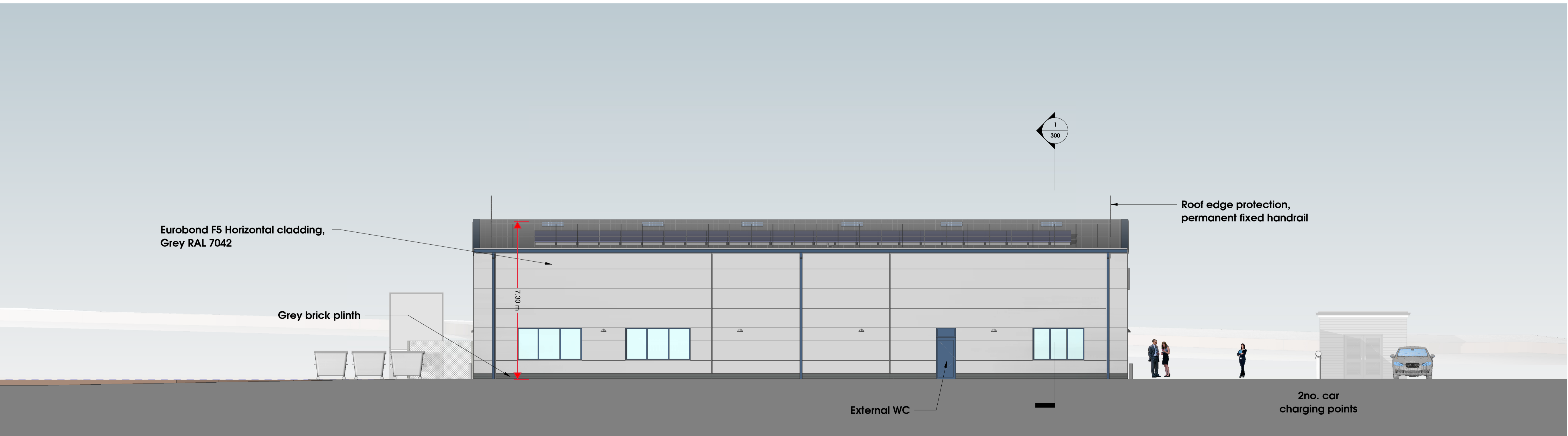
2 South Elevation 1 : 100